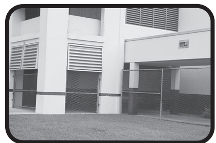
New 6 foot chain link fence at Miramar High School.