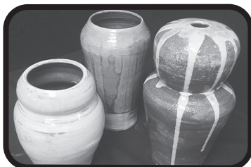
Pottery created by a students at Cypress Bay High School.

As of the close of the last quarter (June 30, 2018), the District delivered 41 kilns to 33 school sites, and had ordered 24 more kilns to service an additional 15 schools. Since June 30, four additional kilns have been ordered with plans for 20 more orders, to supply new kilns to another 16 District schools.