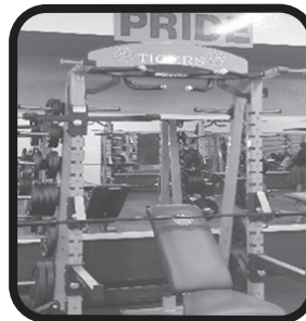
New weight room equipment at Blanche Ely High School.

The SMART Athletics program has hit the ground running this year. All SMART Athletic track projects (15 tracks, including three middle schools and 12 high schools) are complete as of June 30, 2018. In addition, to date, 26 of the 30 high school weight room projects are now complete. Four high school weight room projects are pending completion. These are Cooper City High School (expected to be completed by late October 2018), Coral Springs High School (expected to be completed by early November 2018), Deerfield Beach High School (expected to be completed by the end of November 2018) and Northeast High School (expected to be completed in 2019).