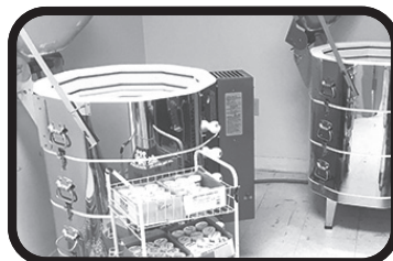
Pompano Beach High School's new kilns.