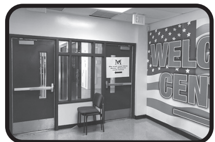
Miramar High School's Welcome Center entryway.