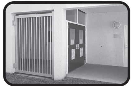
Some of Olsen Middle School's SPE improvements.