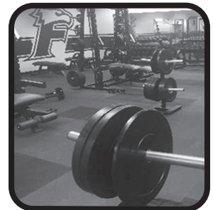
New weight room equipment at Charles W. Flanagan High School.

For more information about the SMART Initiative, visit browardschools.com/smartfutures .