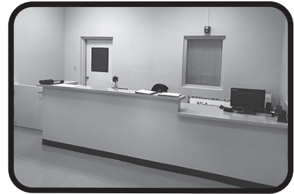
Olsen Middle School's new front desk check-in area.